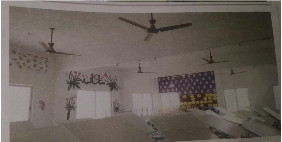
Sewing machine laboratory